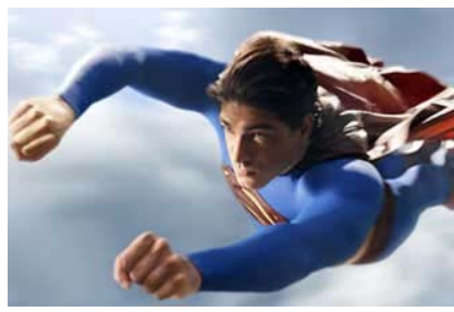
> Advertisement <

Fusce sed massa sed enim scelerisque lobortis. Vestibulum volutpat placerat diam. Fusce vel augue eu felis posuere cursus. Morbi nisi. Integer in purus. Aliquam id mi. Pellentesque eu turpis ac dui iaculis mattis. Vivamus convallis. Morbi libero massa, ornare nec, dapibus at, dictum non, felis. Nam erat mi, viverra consequat, dapibus vitae, facilisis in, eros.